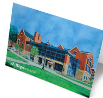
BIFOLD CARD J