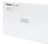
A7 ENVELOPE 7